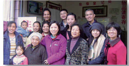
Above: APLP participants connect with a local family during their China Field Study. Bottom: U.S. high school students bonded with Cambodian youth during the AsiaPacificEd Partnership for Youth program.